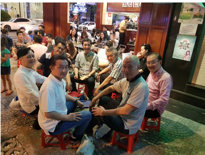
After a hard day's work, coffee!

FGB Malaysia played a key role and after 14 years of engaging the Vietnamese marketplace leaders, four of our leaders were given the rare opportunity to address the leaders of the various Christian organizations and churches present.