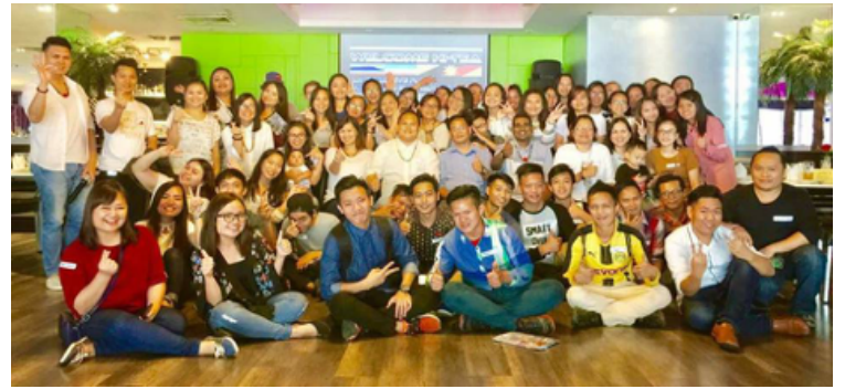
Borneo Christian Students – Hi-Tea at Aryan Restaurant, KL

学生们于6月份在 SS Methodist Church, Kg Sg Kayu Ara 举办 Malam Rentak Bayu Kenyalang 聚会，来自各个教会的民族小组以砂拉越当地传统民族来呈献舞蹈。