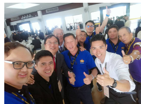
East Coast brothers