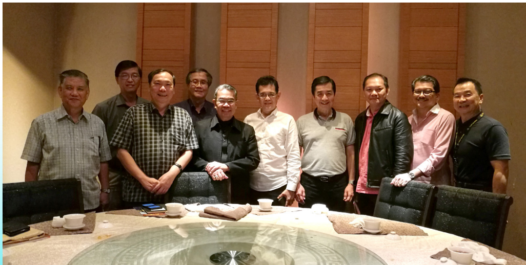
FGB and NECF leaders met together for fellowship