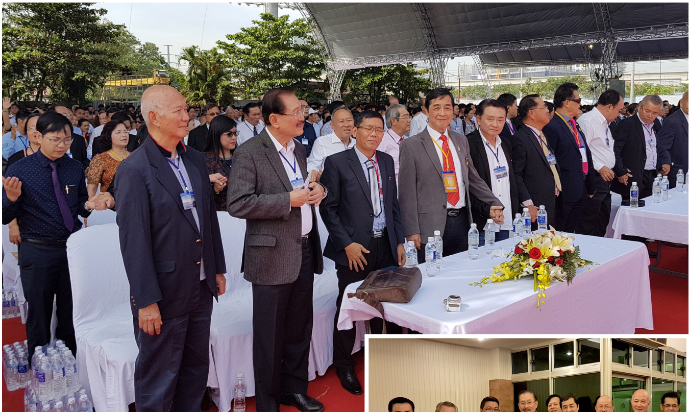
Vietnamese and FGBMFI Malaysia leaders praying in unison.

Nothing short of a miracle, Typhoon Damrey diverted from Ho Chin Minh City during the visit of FGB Malaysia leaders on 2nd and 3rd November to attend Vietnam's Pastors' Conference in celebration of Martin Luther's Memorial. The respite gave two days of clear skies and the typhoon returned after they left! Praise the Lord!