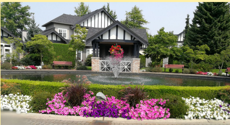
The family is comfortably settled in Vancouver