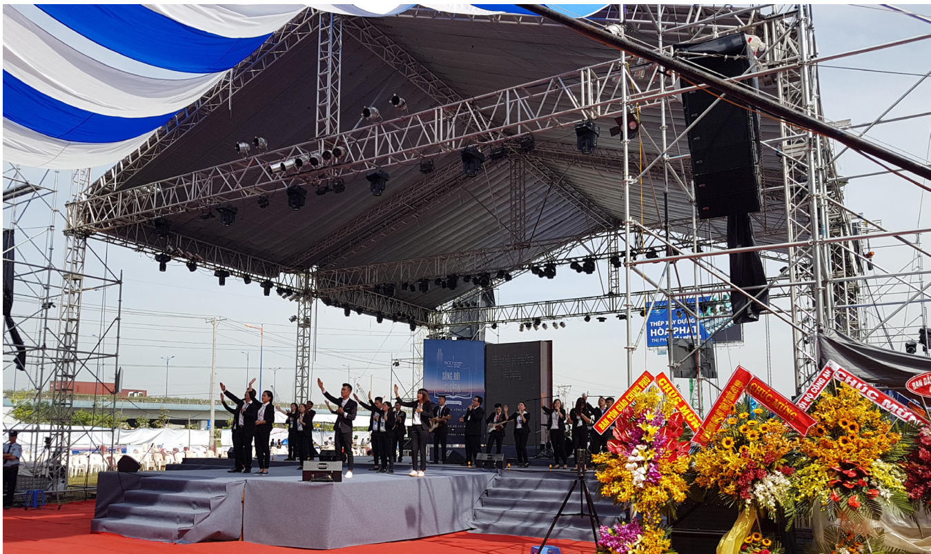
Combine churches youth group leading in Praise & Worship

当马来西亚全福会的领袖于11月 2日至3日到达胡志明市出席马丁路德宗教改革500周年庆典大会时，台风达维突然转移方向，使得这两天的天气晴朗，稍后当他们离开的时候，台风再次来袭！简直就是一个奇迹，感谢主！